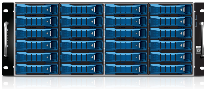
EFS 40NL Front