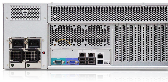
EFS 40NL Rear