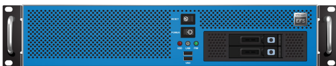
EFS Metadata Server

Flow Database Server - Rack mountable 3U server with 16 HDD